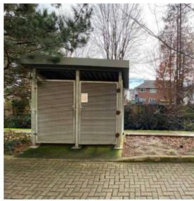
Existing Bin Stores - Capacity for 2no. 1100L bins